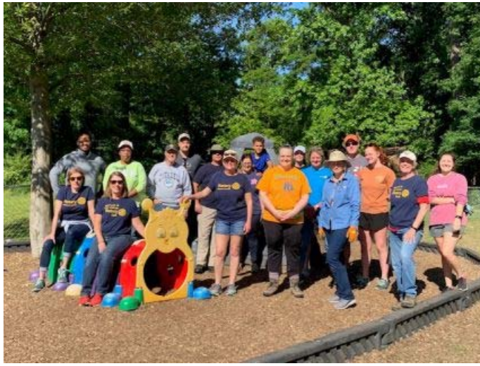
Bon Air Club: